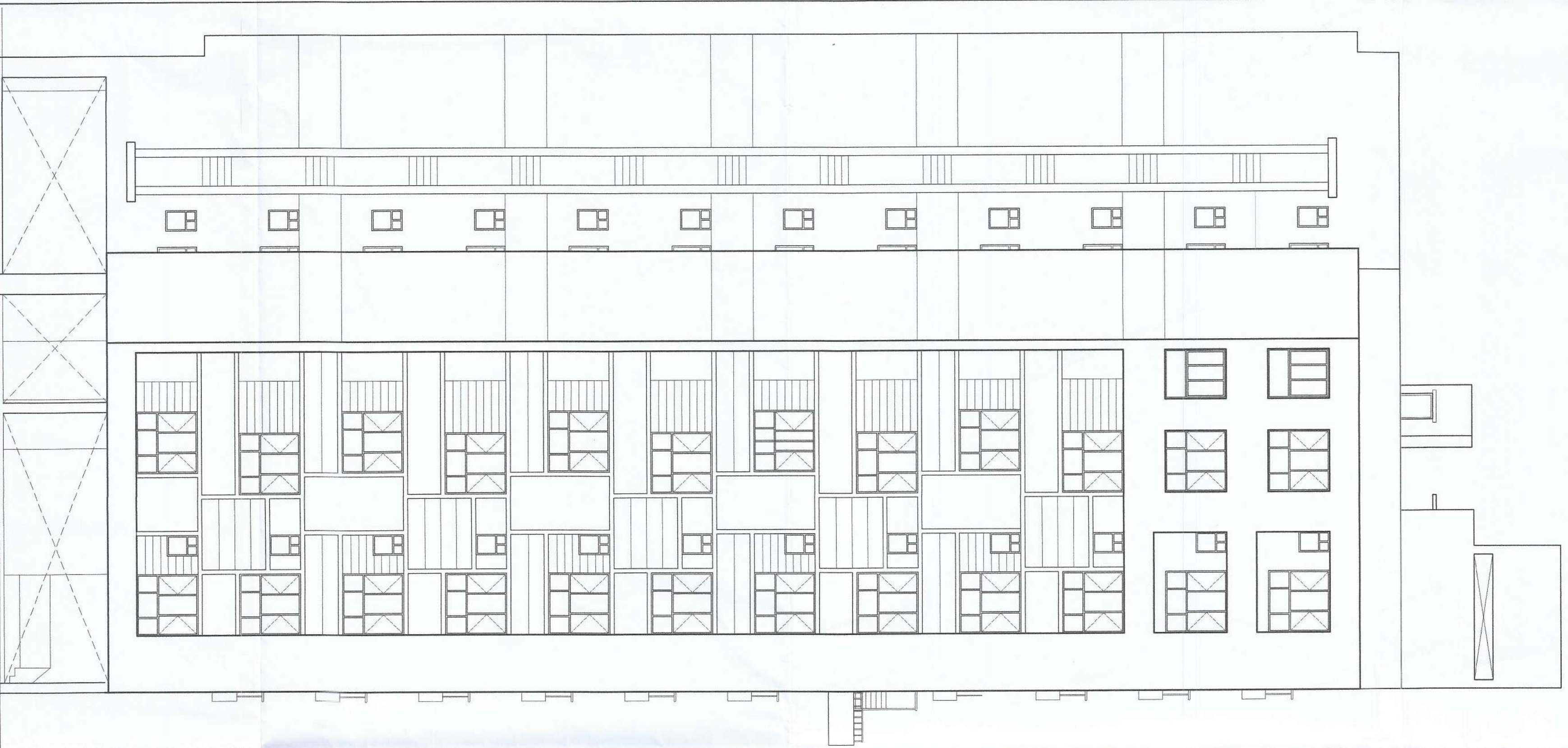
ELEVATION SIDE - A