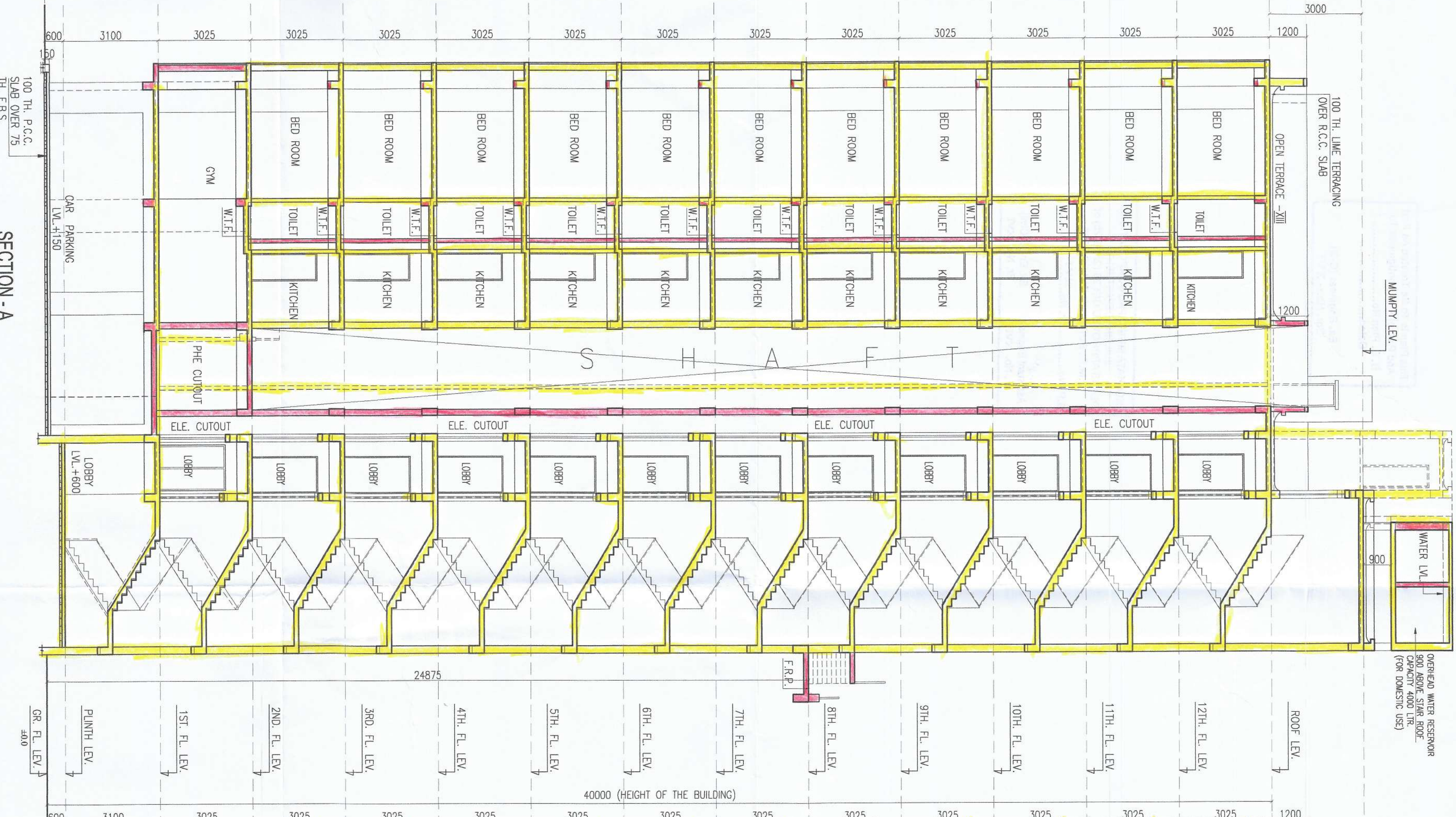
SECTION - A